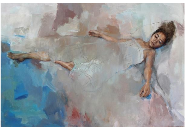
Lucie Geffré – French Ultramarine

The vibrant London art complex Thames-Side Studios is hosting artist-led exhibition and conference Figure This! This vision of contemporary figuration showcases a selection of international artists who demonstrate powerful and diverse engagement with both their materials and the universal appeal of the human figure.